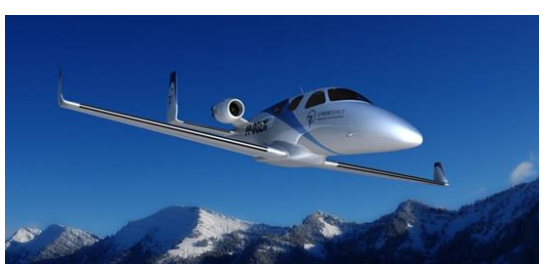
PLJ Design Concept

A new engine for a new class of airplanes.