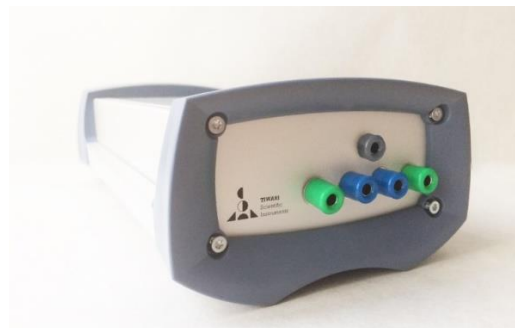
Figure: 3D-printed parts out of ceramics (left) & SHIEL3D Measurement instrument (right)