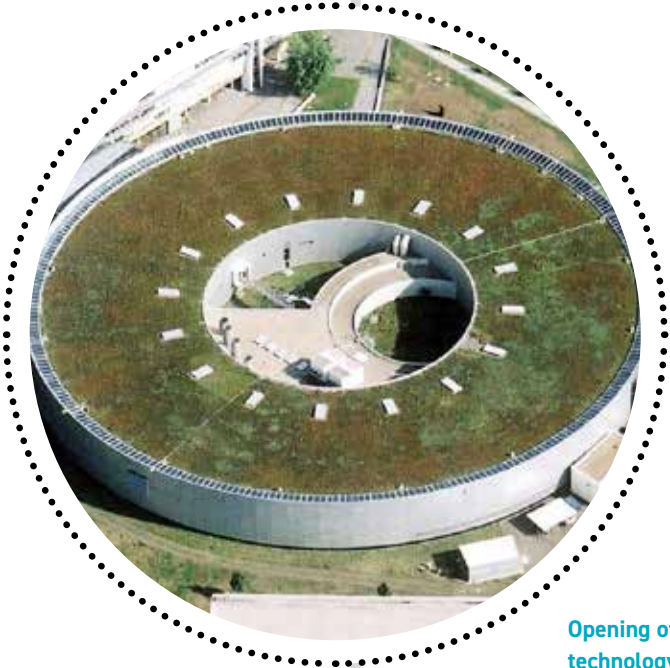
Opening of more technology centres